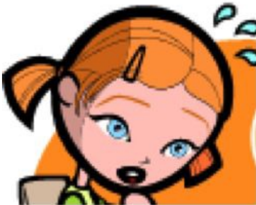
She felt very warm.