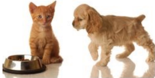
a dog and a cat